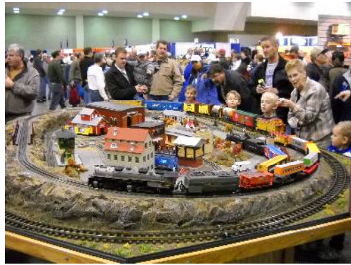
EXHIBIT BOOTH APPLICATION FOR MODEL RAILROAD-RELATED EXHIBITORS